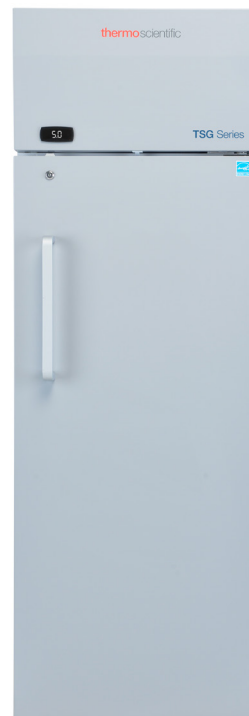
Thermo Scientific™ solid-door refrigerator