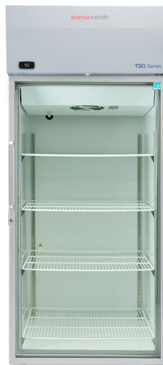
Thermo Scientific™ glass-door refrigerator