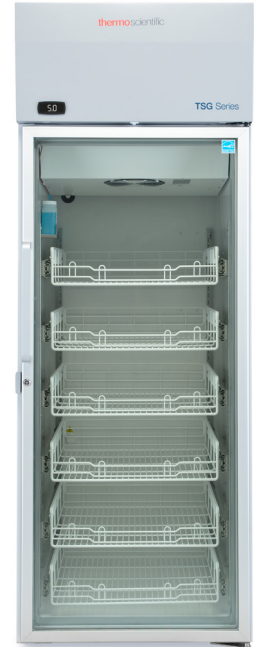
Thermo Scientific™ pharmacy refrigerator