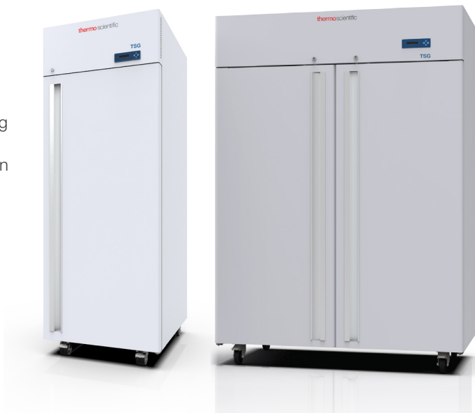
TSG Freezers -12°C to -25°C operating range at set point (-20°C set point)