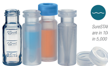
SureSTART vials and caps shown are in 100 pack, but are also available in 5,000 and 10,000 pack options.

penetration area. When resealing for multiple injections is important, we offer snap ring and screw thread caps with a silicone/polyimide septum for trouble free analysis.